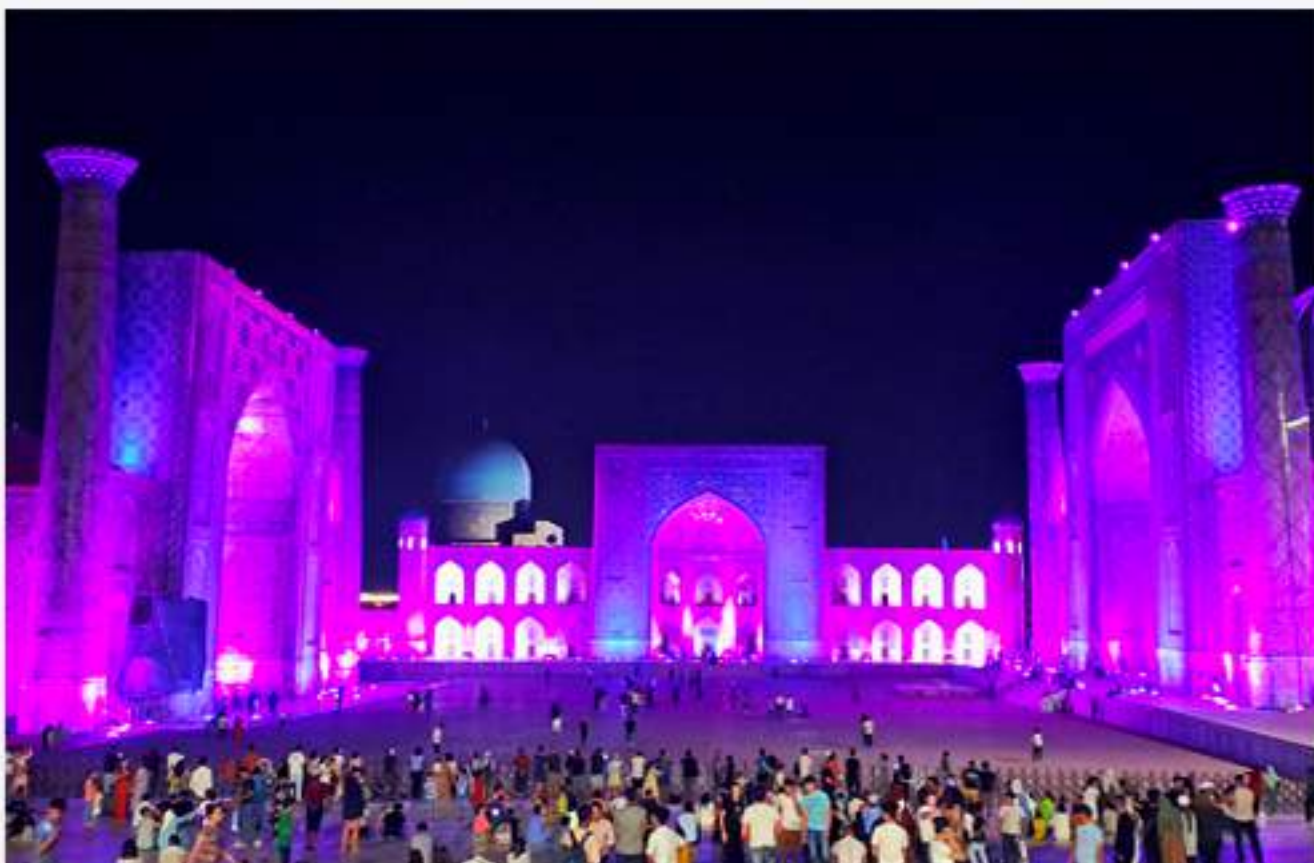
Marvel at the spectacular Registan Square in Samarkand