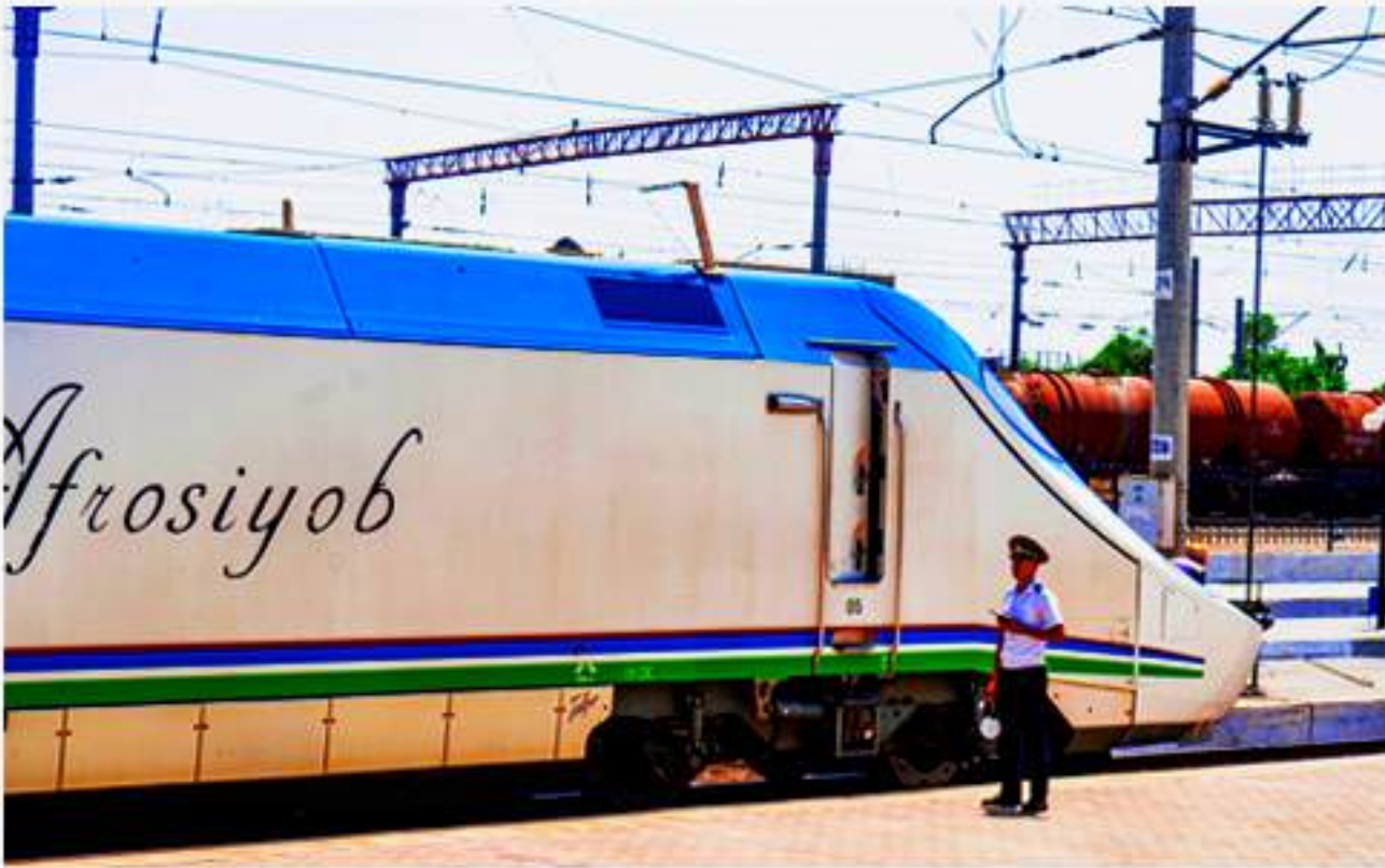
High speed train journey through the Uzbek landscape