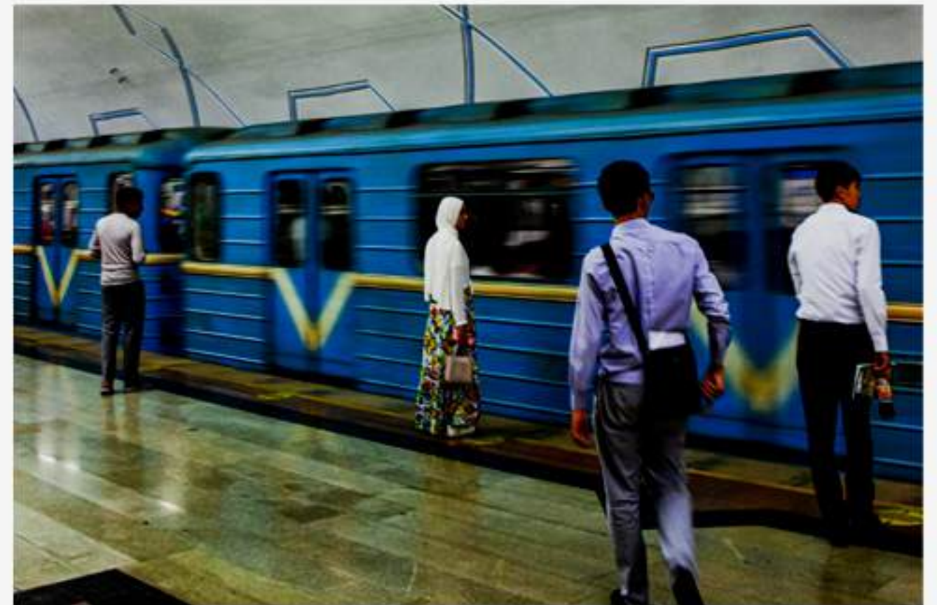
See the Soviet era influence in the capital, Tashkent