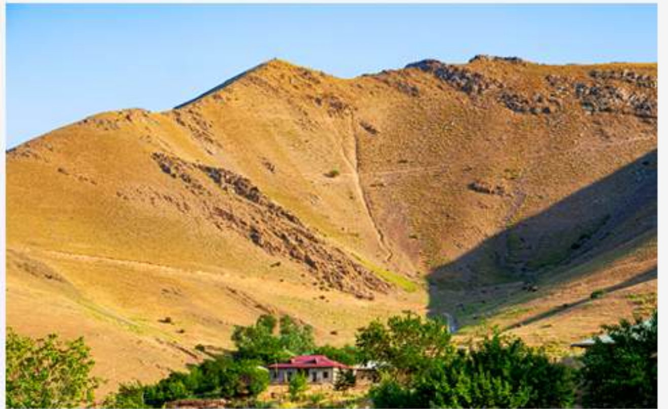
Stay one night at a Tajiki village in the Nuratau Mountains