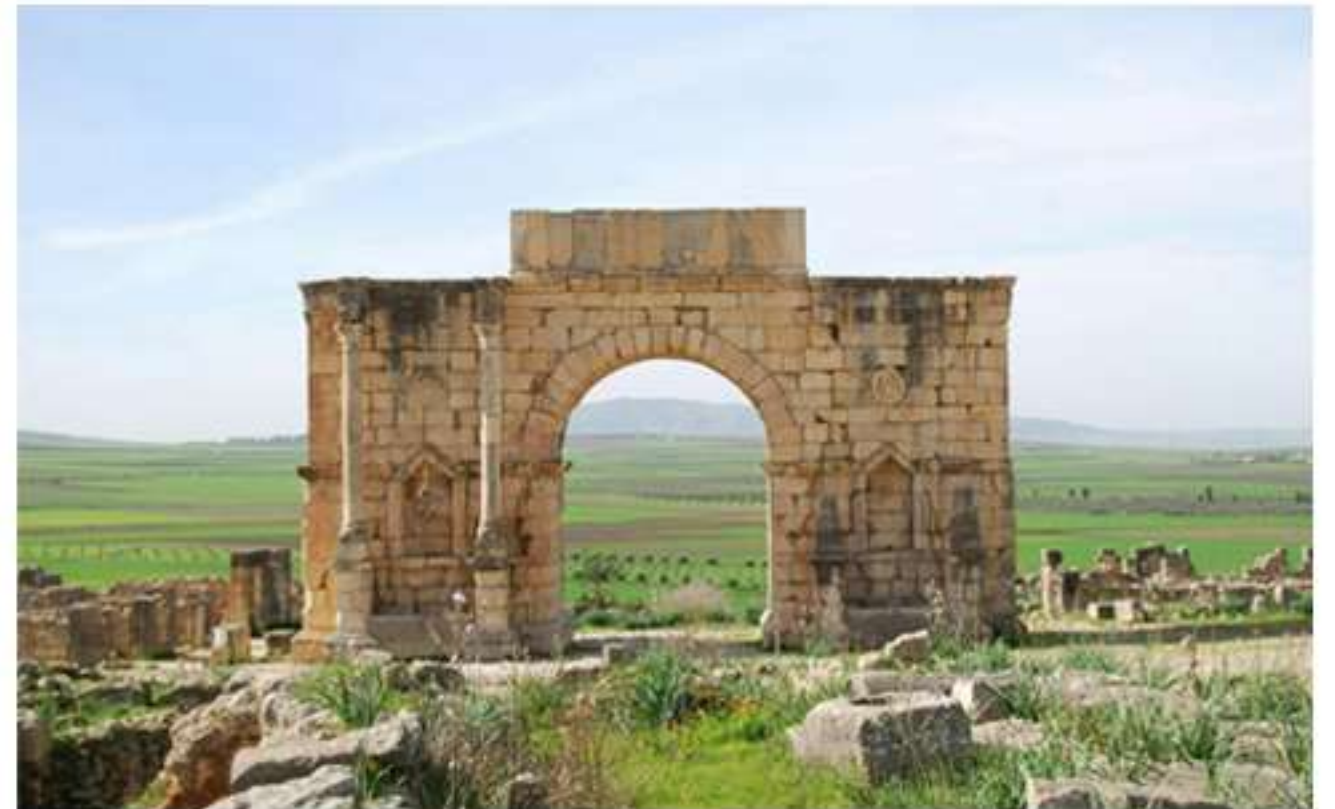
Wander Ancient Roman Ruins in Volubilis