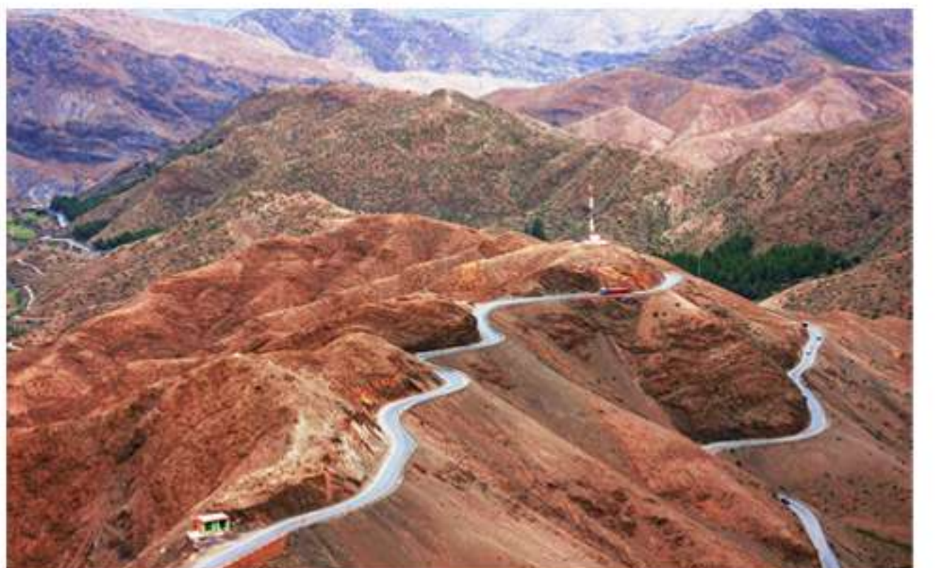
Drive through the beautiful Atlas mountains and Dades Valley