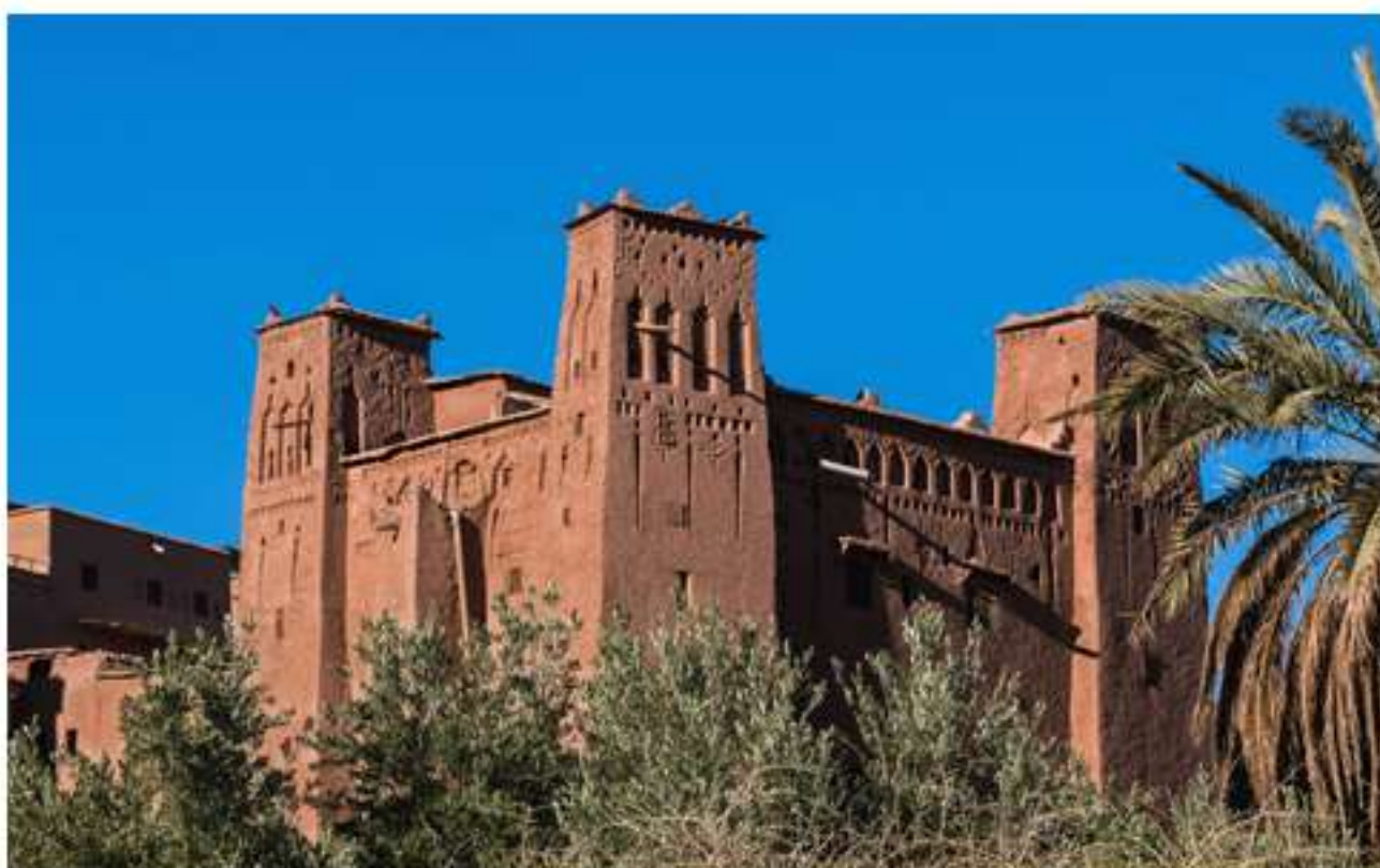
Explore the UNESCO heritage Fortified Village of Ait Benhaddou