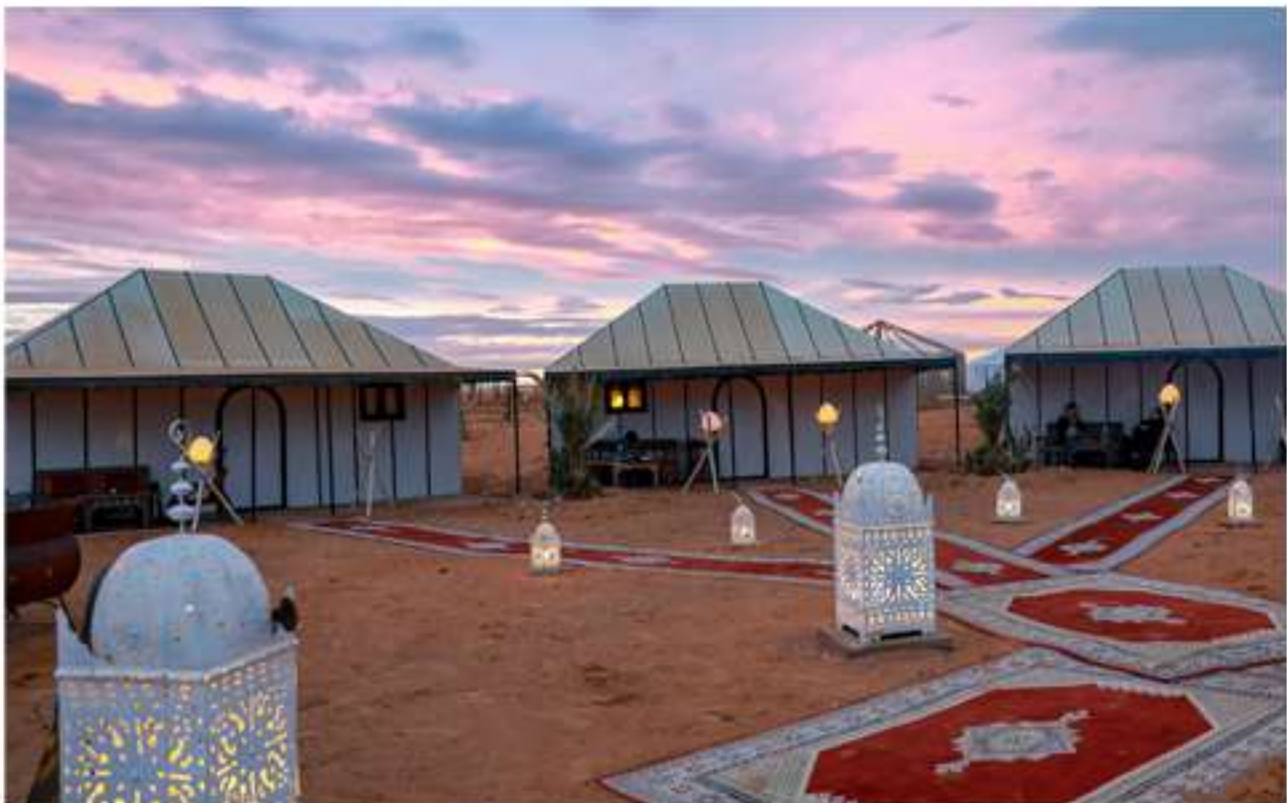
Stay at a luxury camp in the Sahara desert at Merzouga