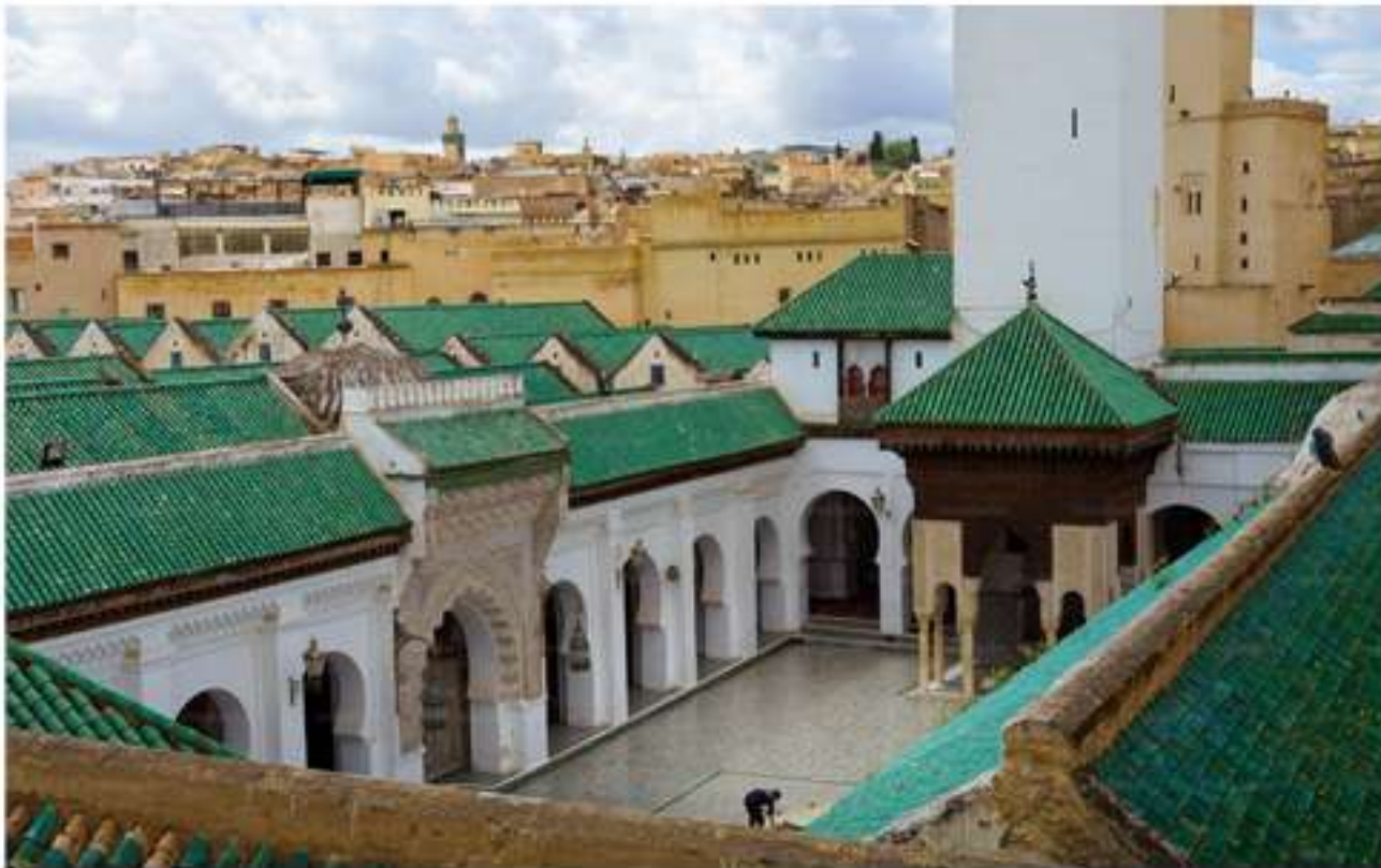
Explore the ancient cities of Marrakesh, Fes and Casablanca