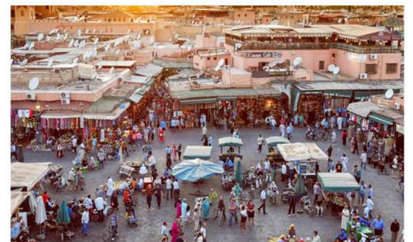
Experience the sheer energy, sights and sounds of Jemaa el-Fna