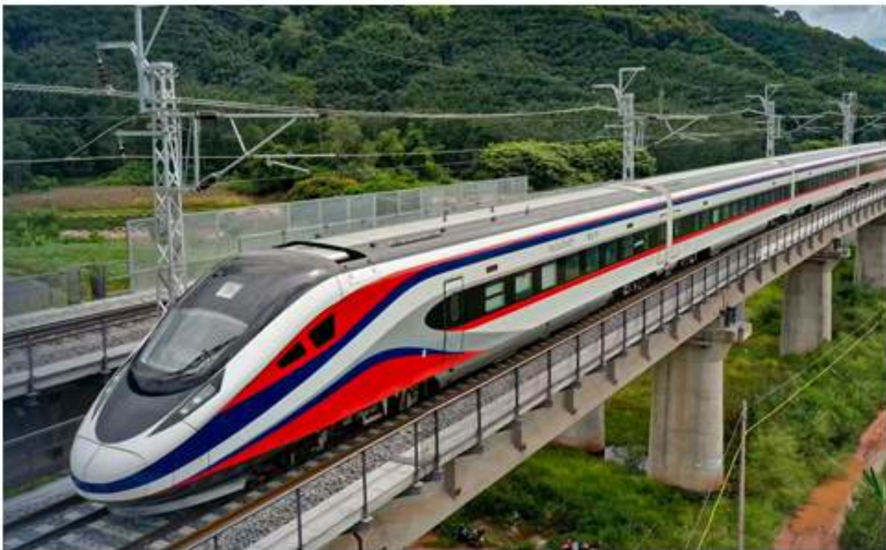
Ride on the China - Laos train - the fastest in South East Asia