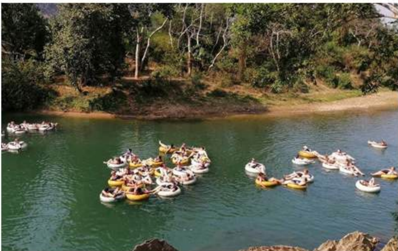
Go kayaking, cave exploration and tubing in Vang Vieng