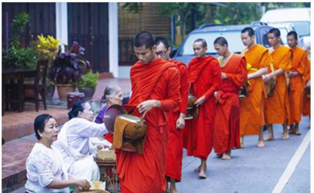
See the morning alms giving ceremony in Luang Prabang