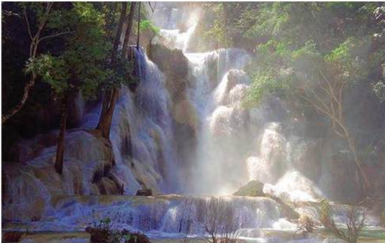
Visit Kuang Si falls - one of the most beautiful waterfalls in Asia