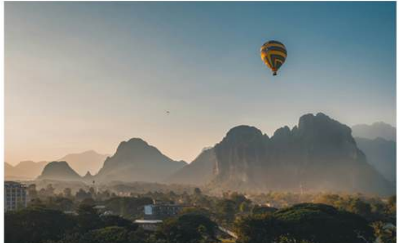
Explore the beautiful landscape of Vang Vieng