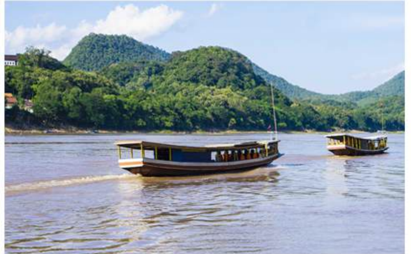
Take an exciting boat Cruise on the Mekong River in Luang Prabang