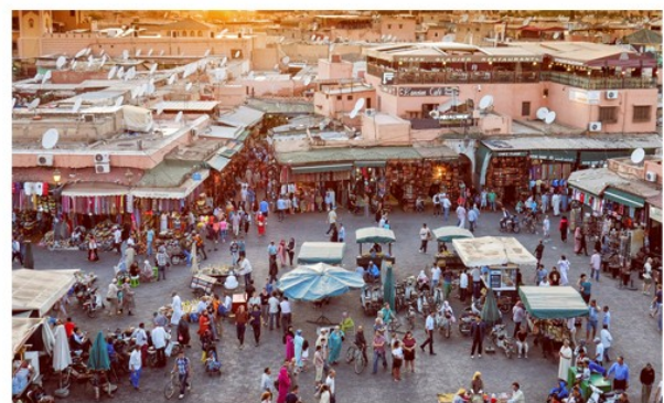
Experience the sheer energy, sights and sounds of Jemaa el-Fna