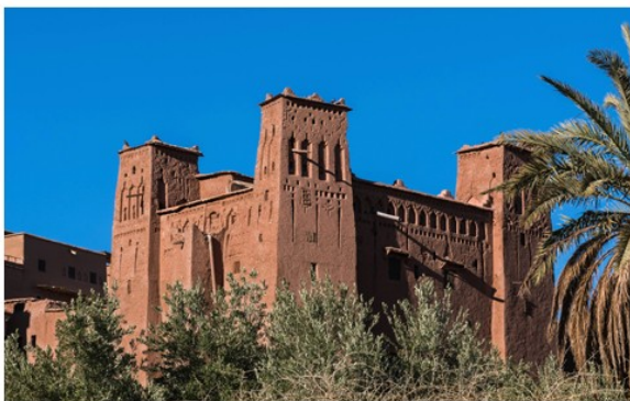
Explore the UNESCO heritage Fortified Village of Aït Benhaddou