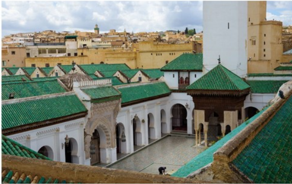
Explore the ancient cities of Marrakesh, Fes and Casablanca