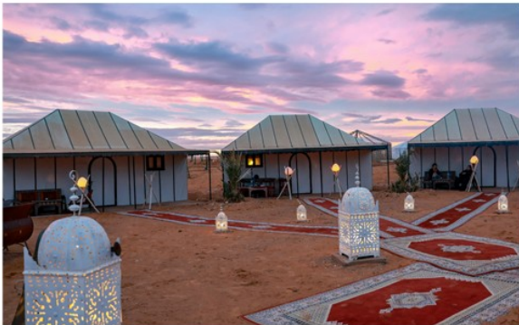
Stay at a luxury camp in the Sahara desert at Merzouga