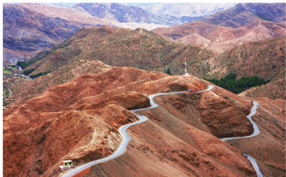
Drive through the beautiful Atlas mountains and Dades Valley