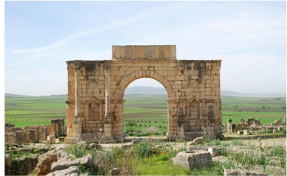
Wander Ancient Roman Ruins in Volubilis