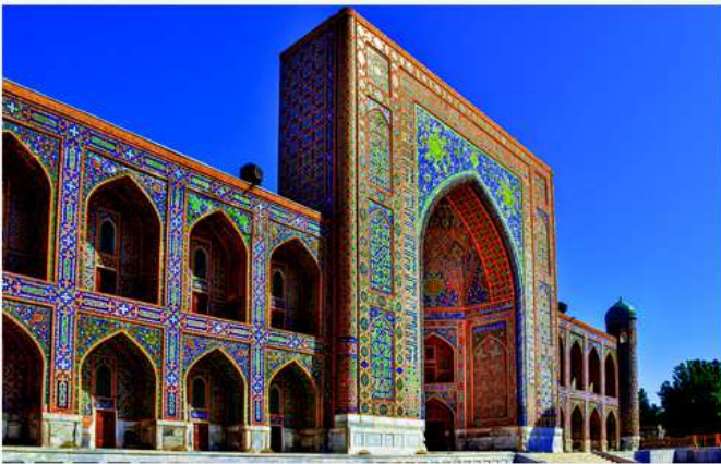
Explore silk road monuments in Tashkent,, Samarkand and Bukhara