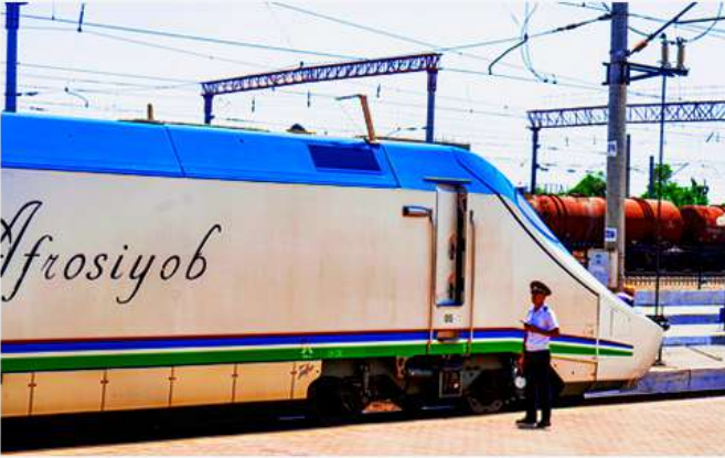
High speed train journey through the Uzbek landscape