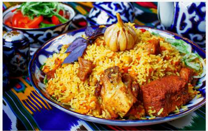
Explore the local markets and try mouth watering Uzbeki cuisine