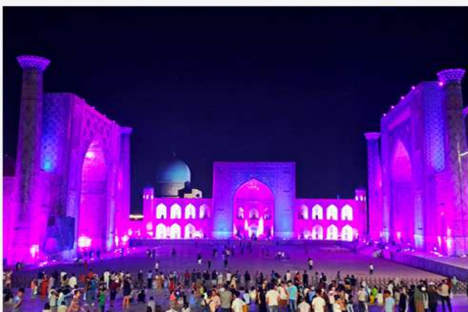
Marvel at the spectacular Registan Square in Samarkand