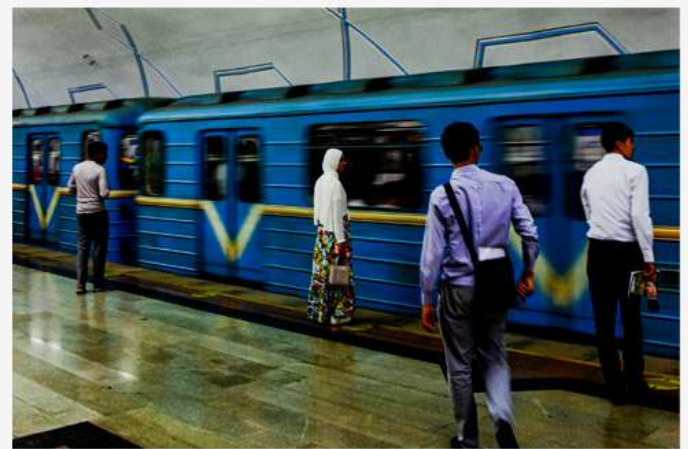
See the Soviet era influence in the capital, Tashkent