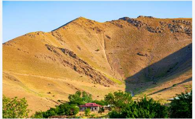
Stay one night at a Tajiki village in the Nuratau Mountains