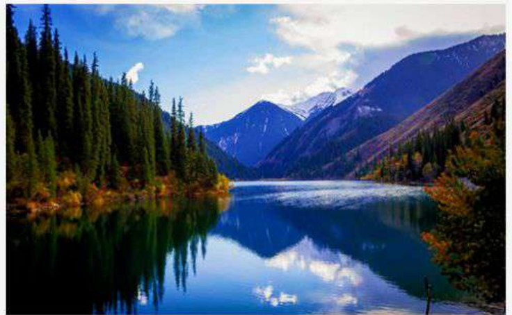
Walk around the beautiful Kolasi and Kiandy lakes