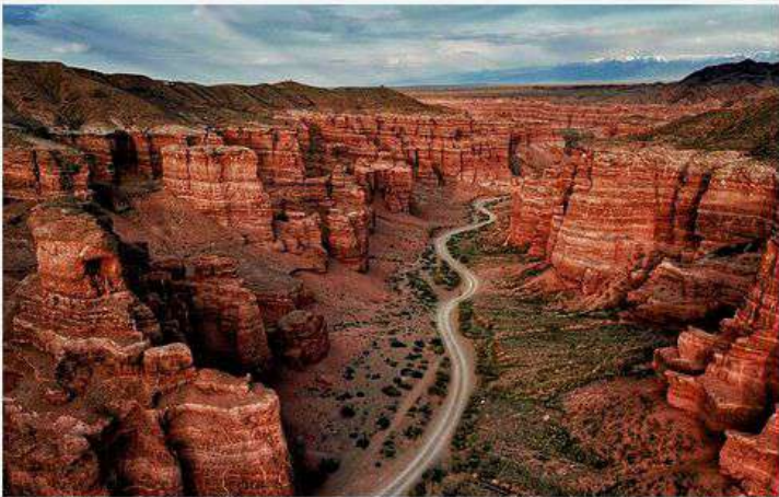
Admire the beauty of the spectacular Charyn Canyon