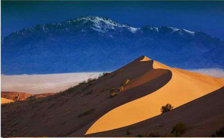
Visit the singing dunes in Altyn Emel National Park