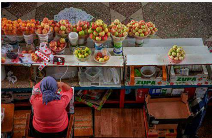
Try the famous Oporto apples at the green bazaar