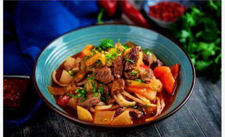
Try traditional Kazakh cuisines like Lagman, Beshmarmak and Kurt