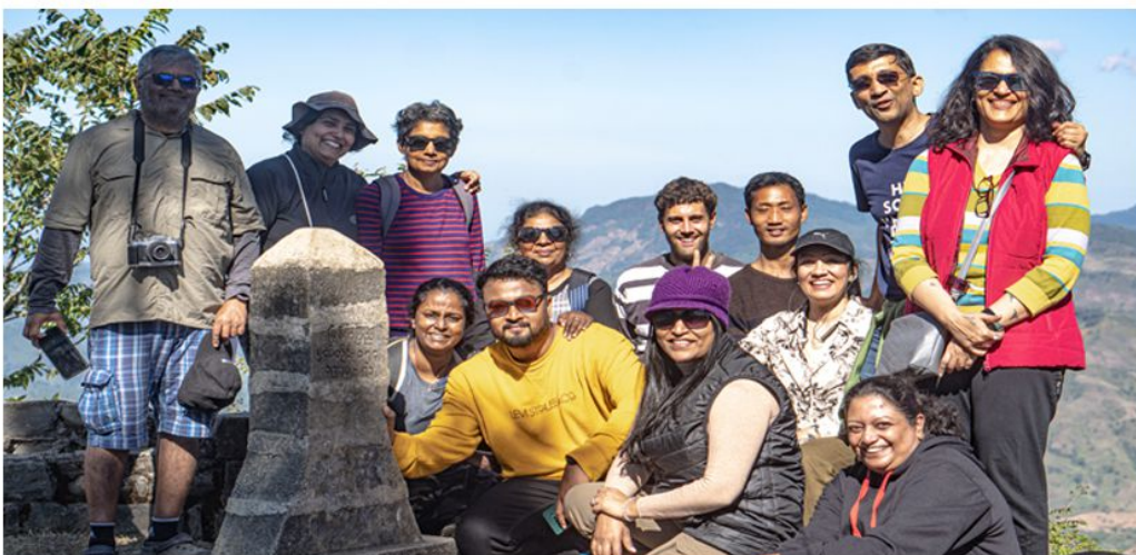
AT INDIA - MYANMAR BORDER PILLAR IN LONGWA VILLAGE WITH 2022 GROUP

After breakfast leave for Kigwema near Kohima, the main venue of the Hornbill festival. We stay at a beautiful homestay near the festival venue. Watch the evening programs of the festival. Overnight at Kigwema.