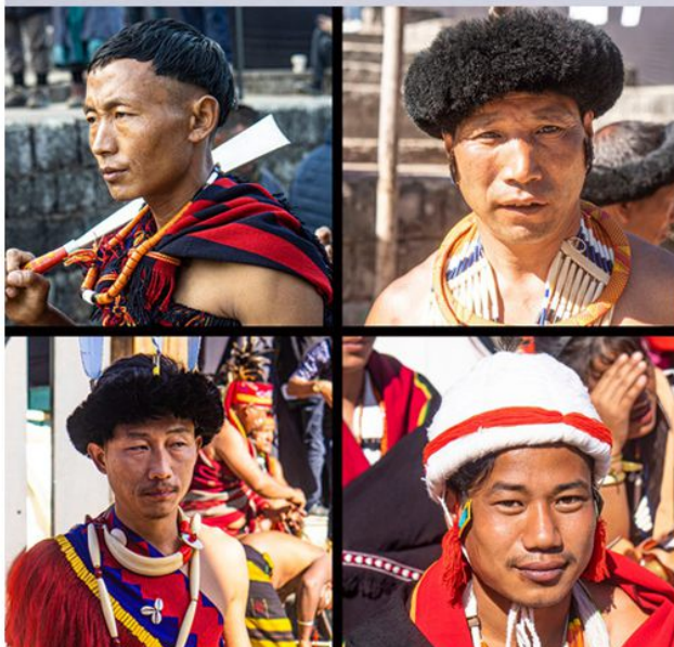
NAGA MEN FROM THE KONYAK , AO , ANGAMI AND SUMI TRIBES AT THE HORNBILL FESTIVAL

At the hornbill festival we see the dance, crafts and cuisines of the different Naga tribes.